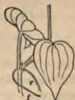
Fig. 9. SMILAX.